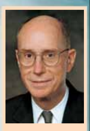
By belping others come unto Him, you will find that you bave come unto Him yourself.

That assurance is not easy to feel in a world in which many voices say that there is no God, that there is no sin, and that happiness is found in pleasure. But our voices can be more powerful if we can get the gift of bearing a sure witness that Jesus is the Christ and the Savior of the world. That witness will come most powerfully out of