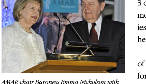
AMAR chair Baroness Emma Nicholson with Elder Jeffrey R. Holland in London, England.

These are only some illustrations of the value of religion in a culture for which we in the religious community do not just advocate but also demand religious freedom, which we