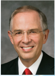
By Elder Neil L. Andersen Of the Quorum of the Twelve Apostles