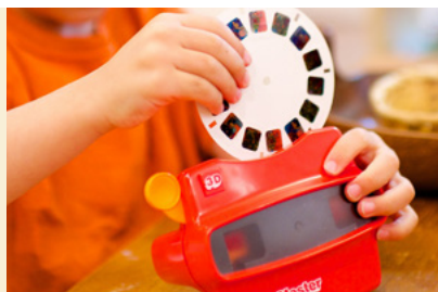
2A. A child’s toy demonstrates the power of superior depth perception.

Multiple scientific analyses illustrate the advantages of two eyes over one. I will explore six of those advantages