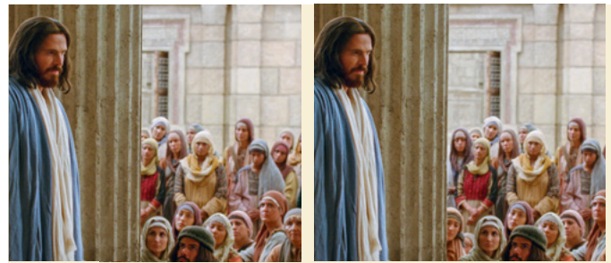
3. Binocular visions helps a person see more of, or all of, an object behind an obstruction. Can you tell the difference?

President Ezra Taft Benson (1899–1994) shared this reassuring promise of the Book of Mormon: “There is a power in the book which will begin to flow into your lives the moment you begin a serious study of the book. You will find greater power to resist temptation. You will find the power to avoid deception . You will find the power to stay on the strait and narrow path.” 7