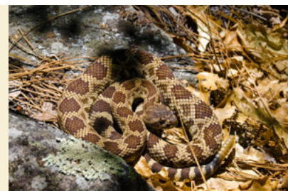
2B. In the animal kingdom, two eyes give potential prey precise depth perception, helping it break the camouflage of predators.

forever remain in that awful state of blindness . . . .