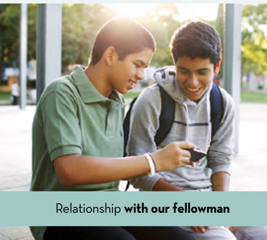
Relationship with our fellowman

“no man cometh unto the Father, but by [Christ]” (John 14:6). To strengthen our relationship with God, we need some meaningful time alone with Him. Quietly focusing on daily personal prayer and scripture study, always aiming to be worthy of a current temple recommend—these will be some wise investments of our time and efforts to draw closer to our Heavenly Father. Let us heed the invitation in Psalms: “Be still, and know that I am God” (Psalm 46:10).