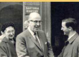
1972: President Harold B. Lee visits members in Italy, the first Church President to visit in latter days