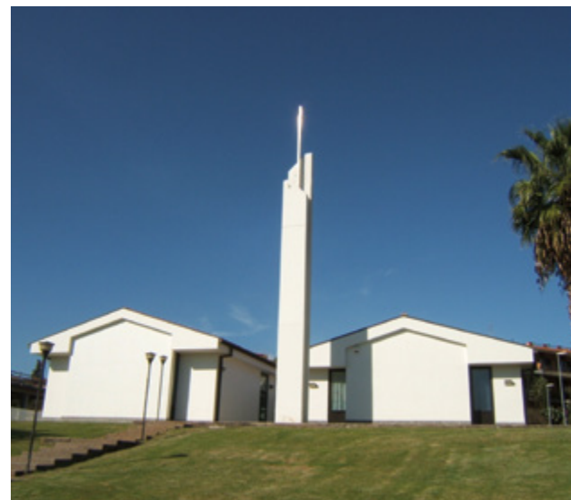
The meetinghouse of the Catania Ward on the coast of Sicily. The Catania Branch was formed in 1967, a year after the Italian Mission was organized.