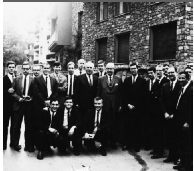
Elder Ezra Taft Benson (center) meets with missionaries of the newly formed Italian Mission.

In 1964, Italy was organized as a district of the Swiss Mission, and soon Italian-speaking missionaries were sent to several cities. In 1966, the Italian Mission was organized, 99 years after the original Italian Mission had closed. Elder Ezra Taft Benson (1899–1994) of the Quorum of the