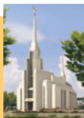
◀ 2008: The Rome Italy Temple announced by President Thomas S. Monson