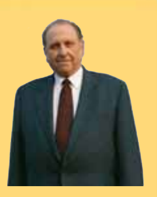
President Monson says that many people in the world need help. He says Heavenly Father wants us to notice them and see how many we can help.

From an address given to the Coalition for Utah's Future, Common Good Awards Luncheon, Oct. 25, 2000.