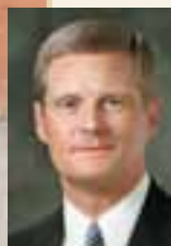
The elder who handed me the 20-mark note was David A. Bednar, a young elder serving in the South German Mission, who is now a member of the Quorum of the Twelve Apostles.