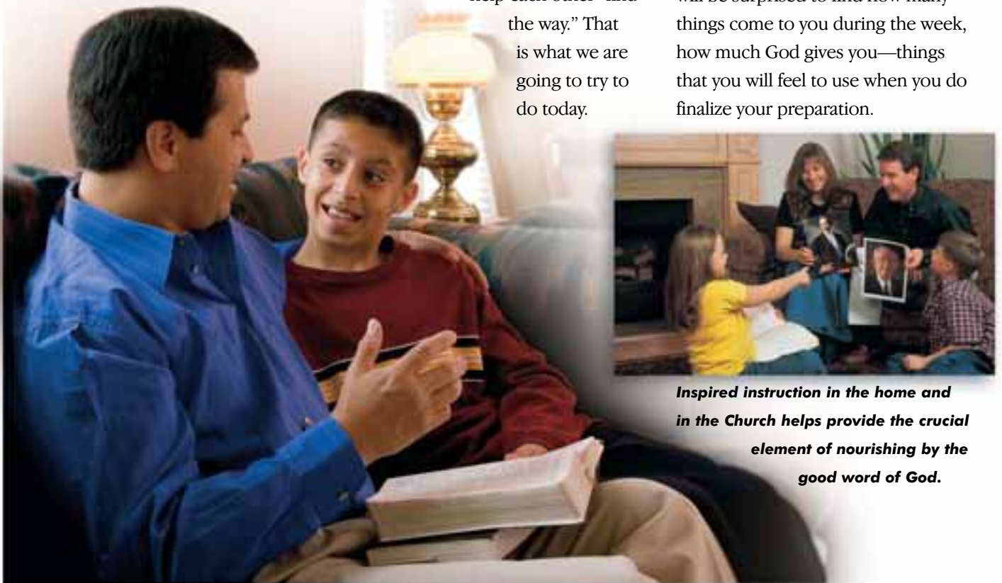
Inspired instruction in the home and in the Church helps provide the crucial element of nourishing by the good word of God.

For example, if I were going to teach a class on Sunday, I would read through and begin praying about that lesson the Sunday before. That gives me a full week to pray, to seek inspiration, to think, to read and watch for real-life applications that will give vitality to my message. You won’t finalize the lesson that early, but you will be surprised to find how many things come to you during the week, how much God gives you—things that you will feel to use when you do finalize your preparation.