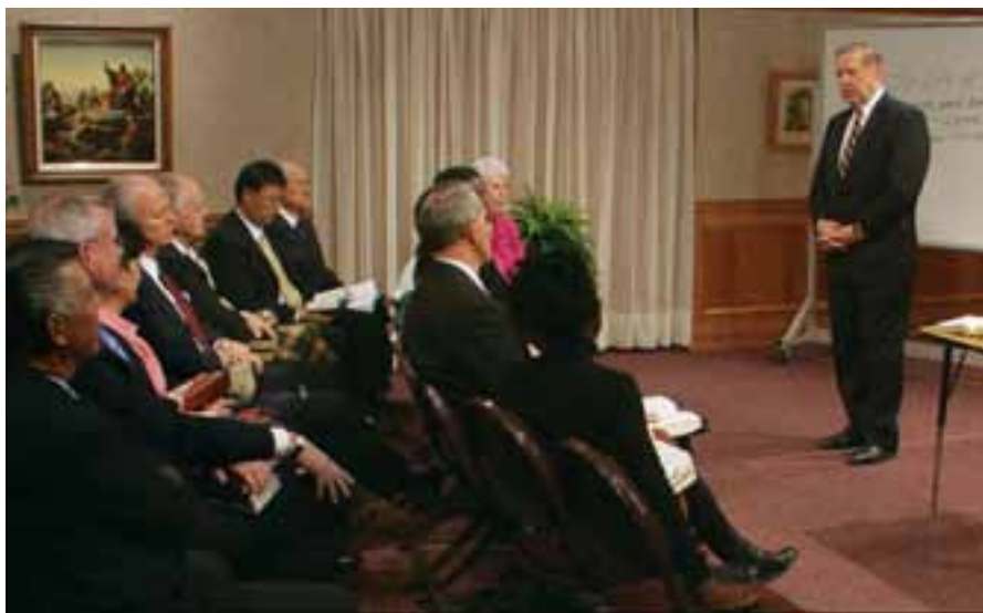
Top: Elder Jeffrey R. Holland prepares for a teaching demonstration, presented as part of the worldwide leadership training meeting. Above: Some members of the Church in the Salt Lake City area were invited to form a class for this teaching demonstration. Some of their additional comments are included in boxes on the following pages.

In discussing preparation, may I also encourage you to avoid a temptation that faces almost every teacher in the Church; at least it has certainly been my experience. That is the temptation to cover too much material, the temptation to stuff more into the hour—or more into the students—than they can possibly hold! Remember two things in this regard: first of all, we are teaching