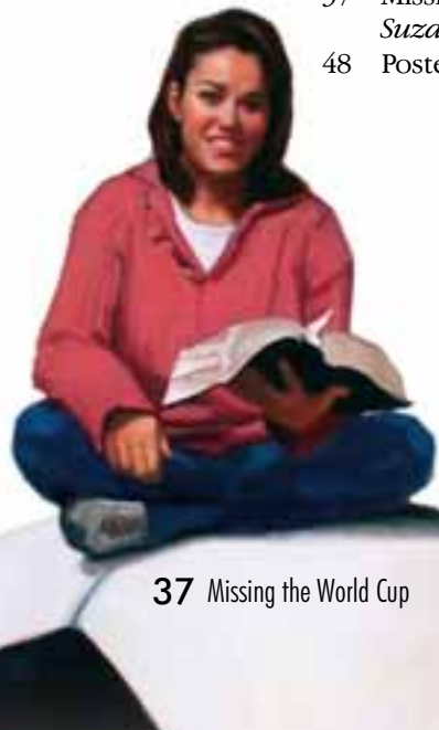
37 Missing the World Cup