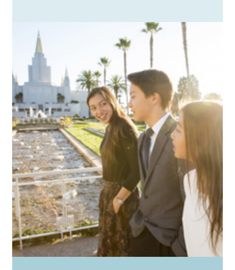
To learn more about going to the temple for the first time, visit "Inside Temples" at Ids.org/temples .

Is your temple recommend current? If you don't have a recommend, you can make an appointment with your bishop or branch president.