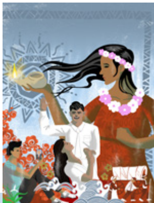
ON THE COVER