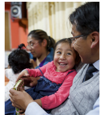
ON THE COVER Photograph of a pioneer family in Bolivia