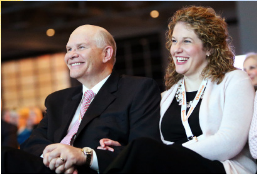
With his wife and daughter, Elder Renlund spoke at the 2016 RootsTech family history conference in Salt Lake City. Opposite page: Married in the Salt Lake Temple in 1977, Elder and Sister Renlund have served the Lord wherever and whenever they have been called.