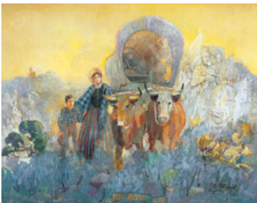
ON THE COVER Front: Not Alone , by Minerva Teichert. Inside front cover:  Inside back cover: