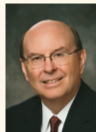
By Elder Quentin L. Cook Of the Quorum of the Twelve Apostles

No good thing will be withheld from them that walk uprightly.