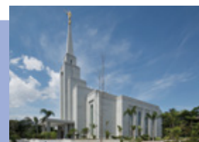
▲ 2012: Manaus Temple dedicated

For every commandment I keep, I receive a blessing.” 6