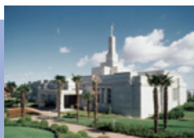
▲ 2000: Recife and Porto Alegre Brazil Temples dedicated