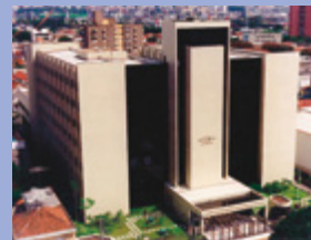
◀ 1997: The Church's second-largest missionary training center is built in São Paulo