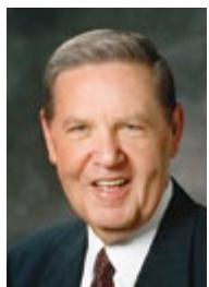
By Elder Jeffrey R. Holland Of the Quorum of the Twelve Apostles