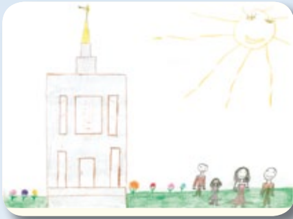
Alina A., age 7, Ukraine