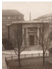
This meetinghouse, built by members, was dedicated in 1931 and later used as a bomb shelter during World War II. After the building was renovated, it became the 118th temple (below).

The original exterior—including a façade with impressive columns flanking the wooden door—was preserved and restored while the interior went through extensive reconstruction. Murals and paintings of scenes from local landscapes exemplify the temple’s distinctively Danish and Swedish