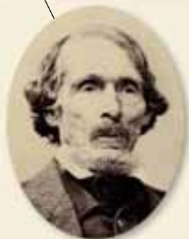
William W. Phelps

Sometime around 1834–35 in Kirtland, Ohio, Revelation Book 2 was used for the preparation of the 1835 Doctrine and Covenants, and all but eight items in the manuscript book were published in that 1835 volume. In contrast, just three of the revelations copied into the book were published in A Book of Commandments in 1833. Two of the manuscript book’s revelations were first published in the 1844 Doctrine and Covenants.