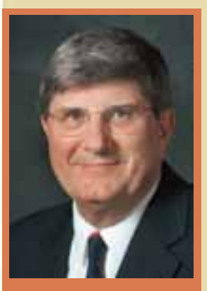
The Lord will shape your life to His purposes if you will let Him. And great blessings will result.