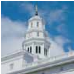
Above, from top: Curitiba Brazil Temple under construction, December 2006. Helsinki Finland Temple, dedicated on October 22, 2006. Nauvoo Illinois Temple, dedicated on June 27, 2002. Today, 124 temples are in operation, and 11 more have been announced or are under construction.

this is the dispensation of the fulness of times.