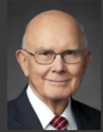
By President Dallin H. Oaks

I am a 65-year student of the life of Joseph Smith. I was