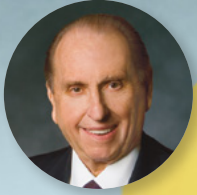
By President Thomas S. Monson