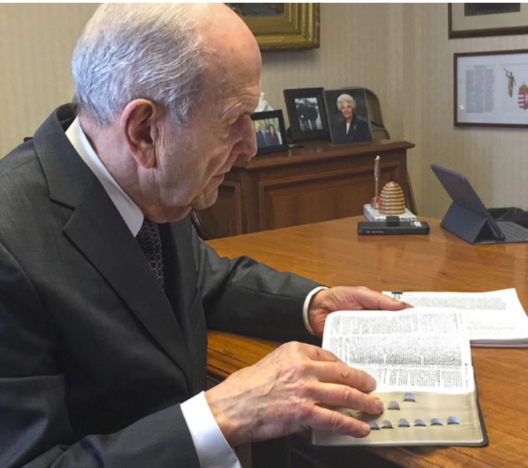
After six weeks of study, President Nelson completed his assignment.

“I have devoted much of my 93 years to learning about the Savior, but rare are the occasions when I have been able to learn as much as I did over this six-week study period.”