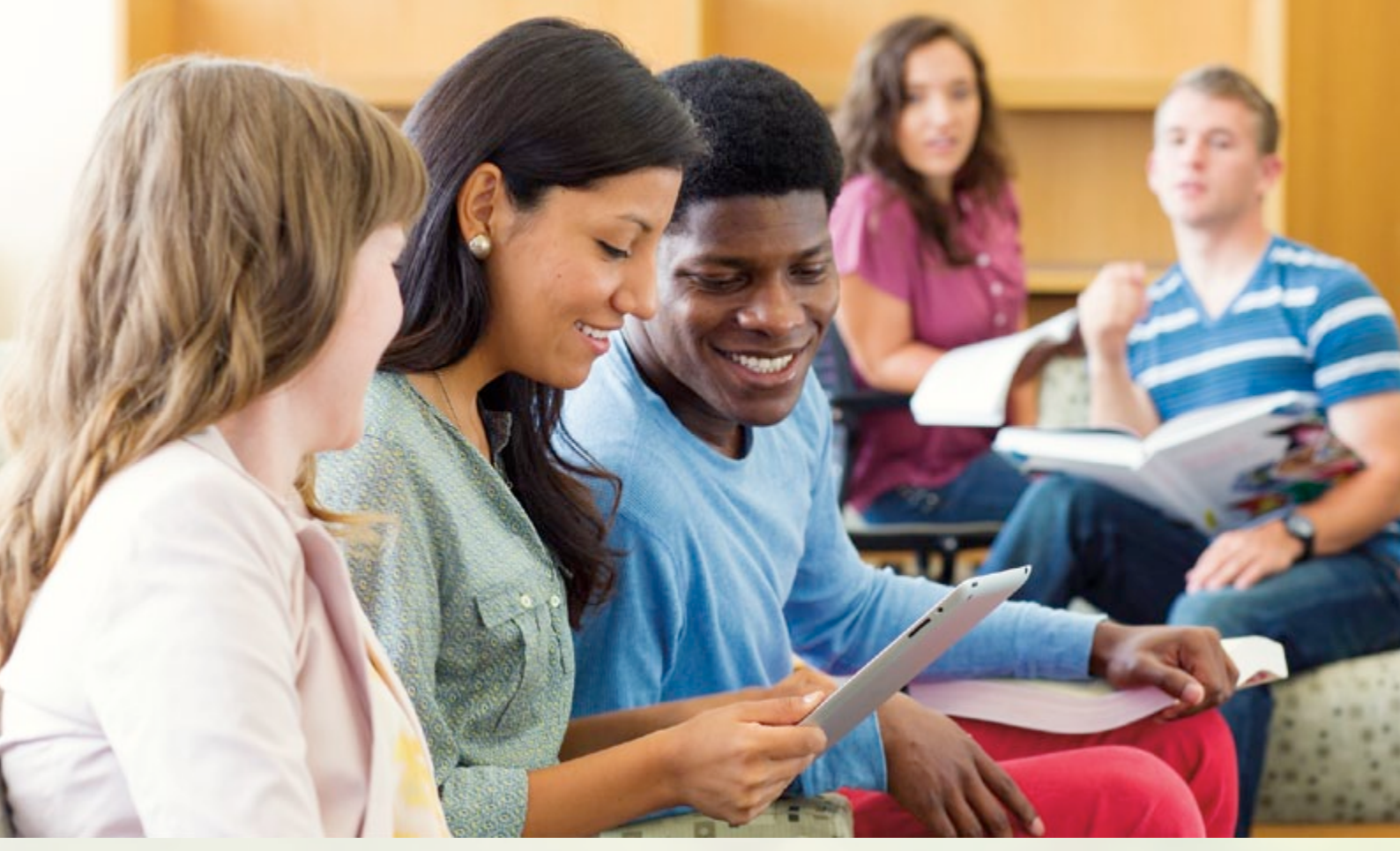
Many new discoveries will be made to help bring to pass the purposes and work of God and to quicken, including through missionary work, the building of His kingdom on earth today.

will be built to bless the Saints, as has been prophesied regarding premillennial growth of the Church.