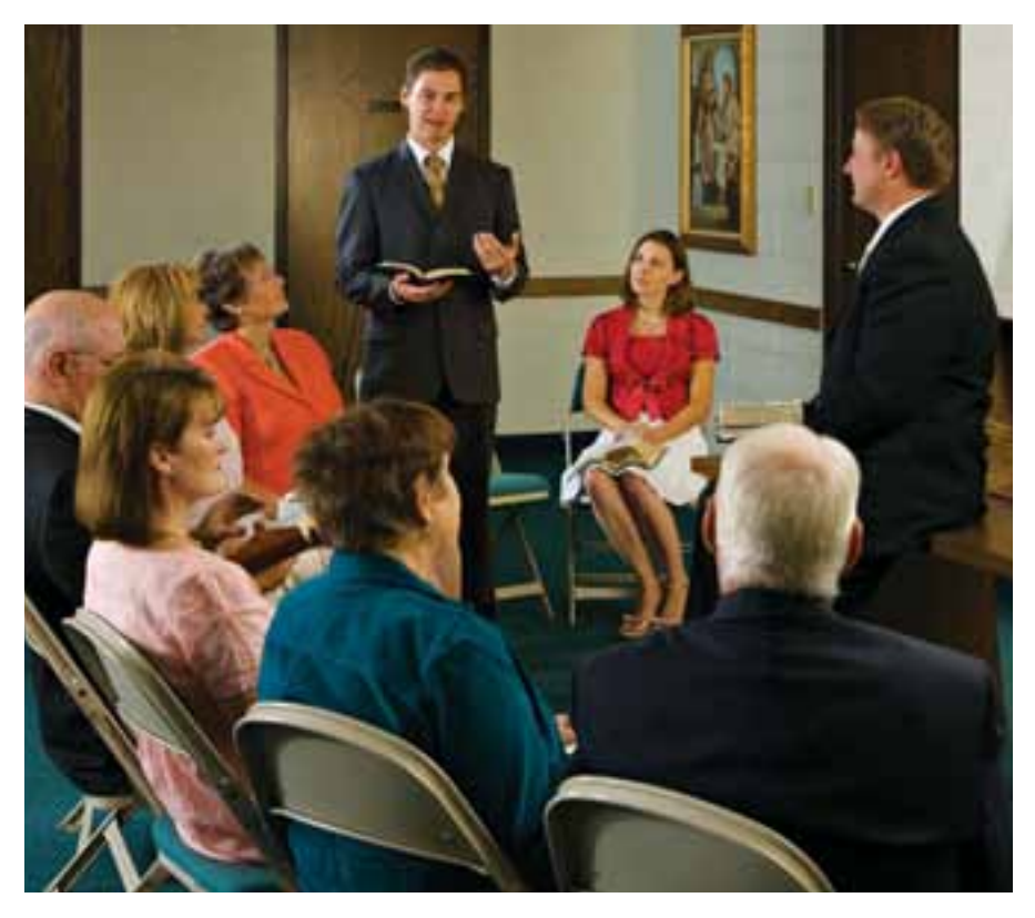
powerful gospel teaching and inspired learning occur when teachers and learners understand that the real teacher in any Church class is the Holy Ghost and that classroom participation invites the Spirit to bear witness.

"After Hurricane Mitch passed through Central America in 2001 and left everything in desolation, I had many questions," he says. "Seeking answers, I went to a friend I greatly respect. He said, 'Read the scriptures. You will find the best answers to your questions in them.'