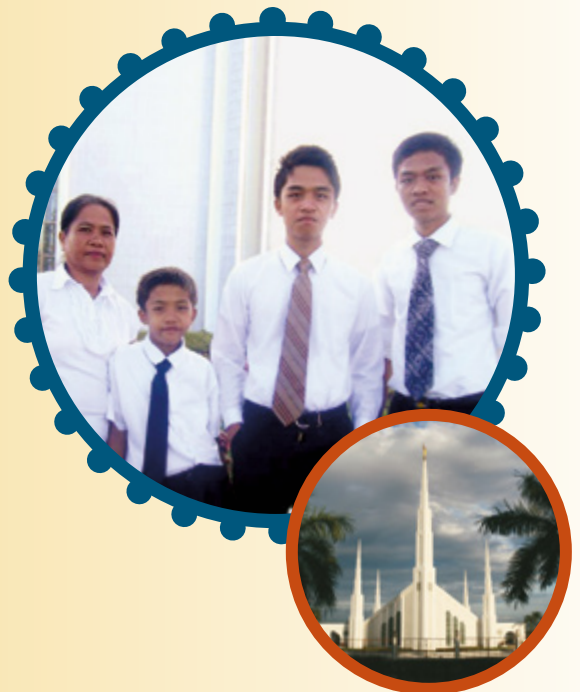
ILLUSTRATION BY DAVID MALAN