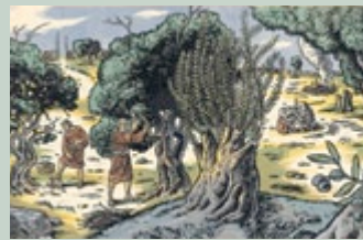
Lehi (Nephites and Lamanites)

Jacob 5:3-14 (to be continued in part 2)