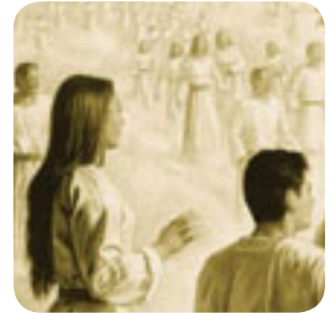
1. We met in a great Council in Heaven with our Heavenly Father to hear His plan.