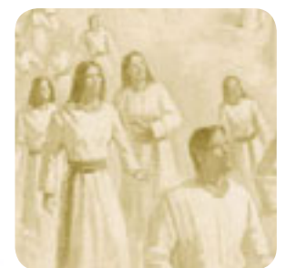
6. We “shouted for joy” (Job 38:7).

H eavenly Father prepared a plan to help us become as He is and to receive a fullness of joy. He said, “This is my work and my glory—to bring to pass the immortality and eternal life of man” (Moses 1:39).