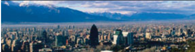
A view of Santiago, Chile's capital city.