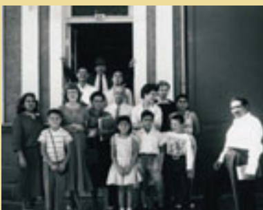
Members and missionaries in Costa Rica in 1956.

W ith the Caribbean Sea on the east and the Pacific Ocean hugging it on the west, Costa Rica is a country where the gospel flourishes from sea to sea. Test your knowledge of Costa Rica with the following quiz.