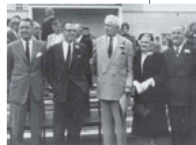
President David O. McKay (center) and other Church leaders at the dedication of the Bern Switzerland Temple in 1955.