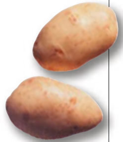
LEFT