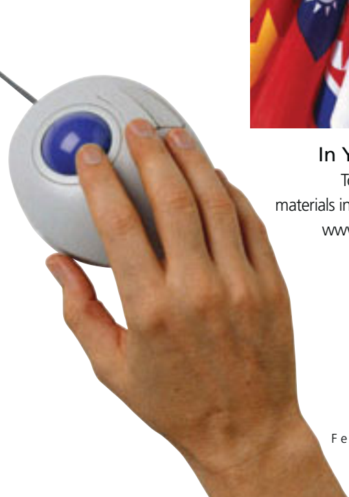
RIGHT: PHOTOGRAPH OF MOUSE AND FLAGS © GETTY IMAGES

To find online Church materials in your language, visit www.languages.lds.org .