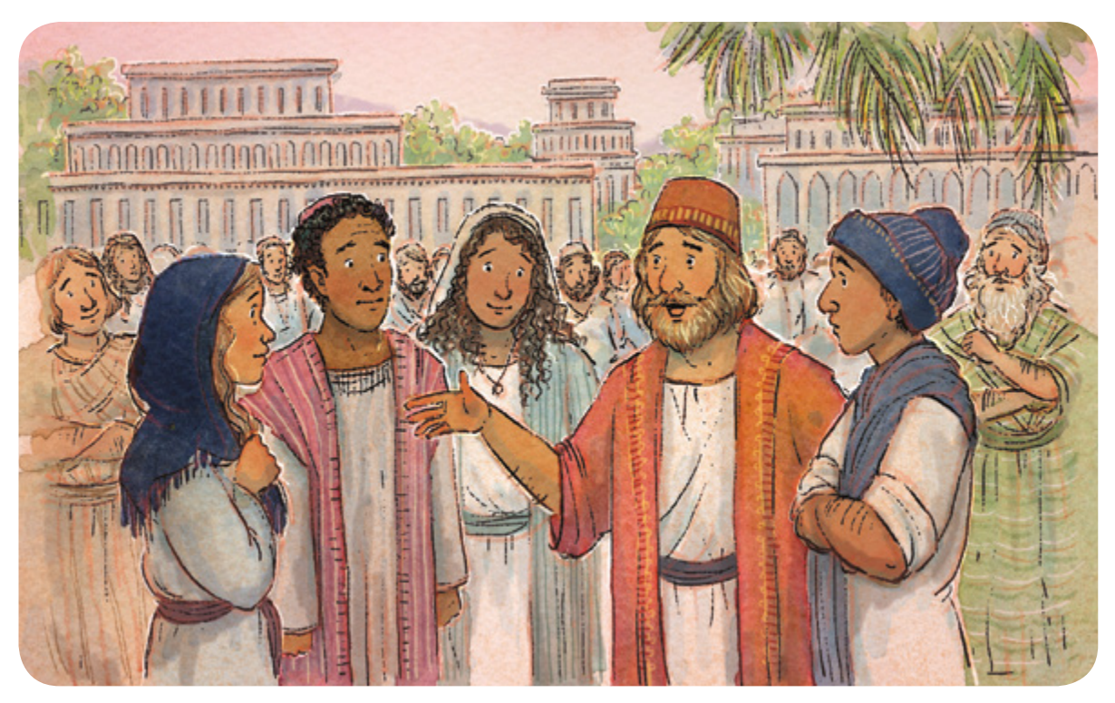
Jonah went to Nineveh. He taught the people there. And the people of Nineveh listened! They started following God again.