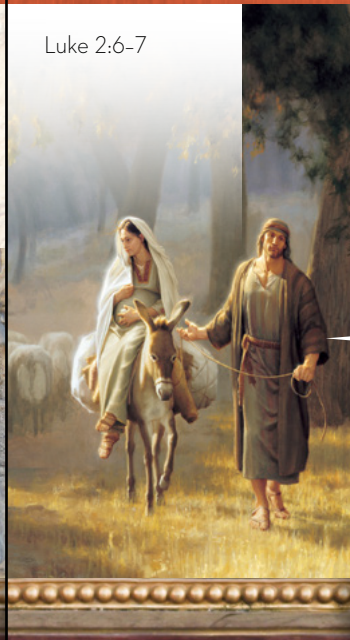
NAZARETH, BETHLEHEM, AND JUDEA