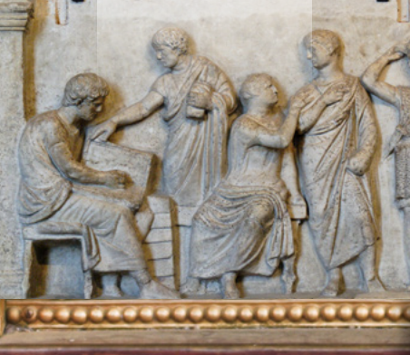
THE ROMAN EMPIRE