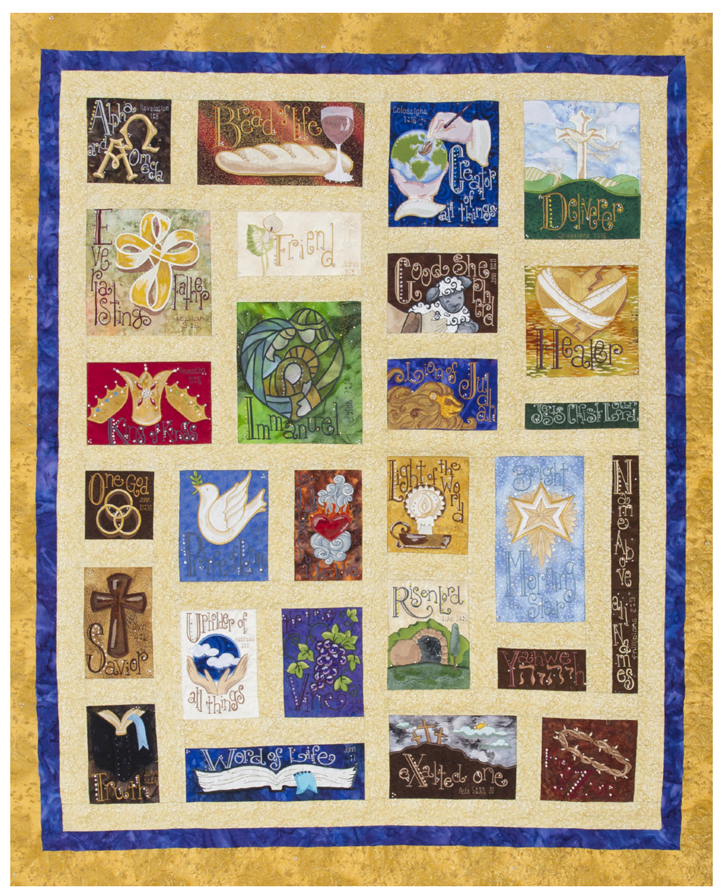
My sister made a beautiful quilt and called it "Name above All Names." The quilt features 26 of the names of Jesus Christ.