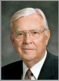
By Elder M. Russell Ballard