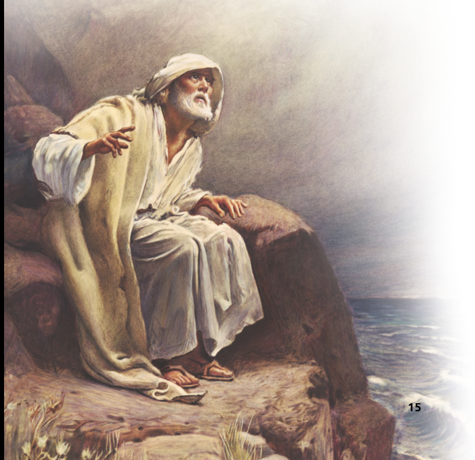
PHOTO ILLUSTRATION BY CHRISTINA SMITH; JOHN ON PATMOS, BY HAROLD COPPING © PROVIDENCE COLLECTION

By the early 19th century, when God called Joseph Smith as the Prophet of the Restoration, the book of Revelation was included in almost all versions of the Bible and was widely read. The imagery of John's vision stoked people's imaginations and gave rise to