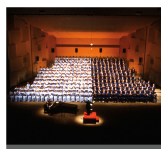
The Mormon Tabernacle Choir performed in the Stockholm Concert Hall in 1982.

Emigration largely ceased when a temple was dedicated in Switzerland in 1955. For 30 vears the Swedish members made the severalday journey there by train, by bus, by car, and even by air—sometimes several times a year.