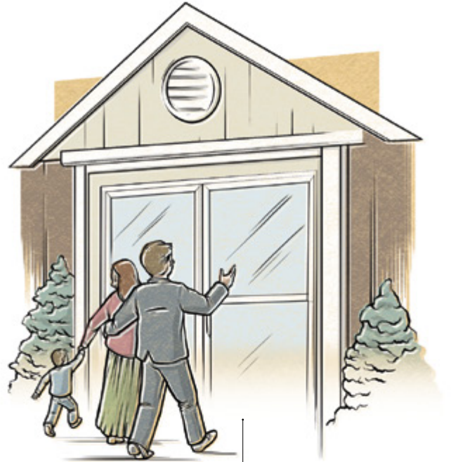
Tithing pays for the cost of building and maintaining temples and meetinghouses.