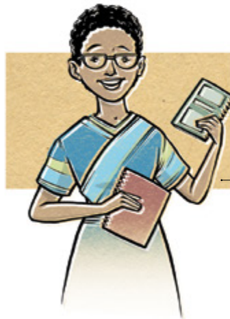
Tithing pays for the translation and publication of scriptures and lesson materials.