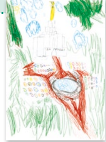
Tima B., age 6, Ukraine