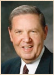
By Elder Jeffrey R. Holland Of the Quorum of the Twelve Apostles