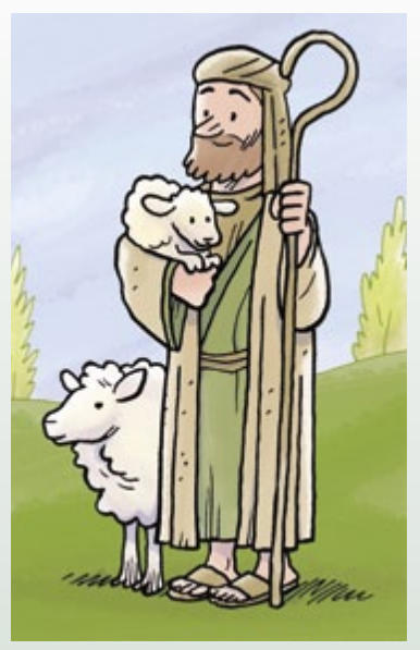
Shepherd (see Psalm 23:1)

Jesus Christ compared Himself to many things. By studying these comparisons, we learn more about Him. Read these scriptures as a family and discuss what these symbols tell us about the Savior.