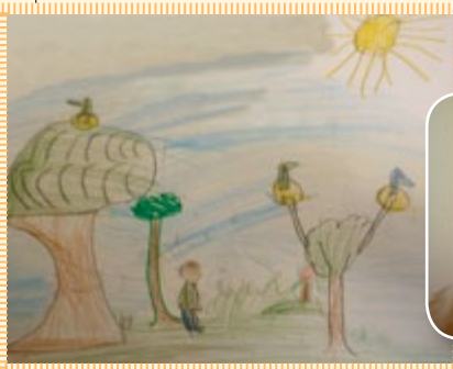
The Sacred Grove, by Axcel C.