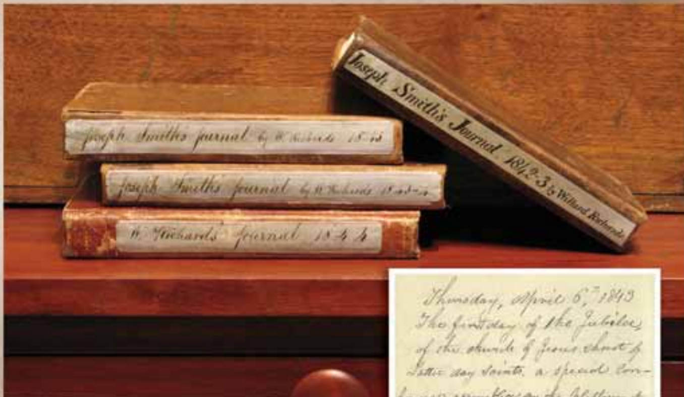
Above: The third Illinois journal is a four-volume set for which Elder Willard Richards acted as scribe. The desk and document box shown here are believed to have come from the Smith family home in Nauvoo. Inset: This journal entry of April 6, 1843, records the opening day of a Church conference in Nauvoo.