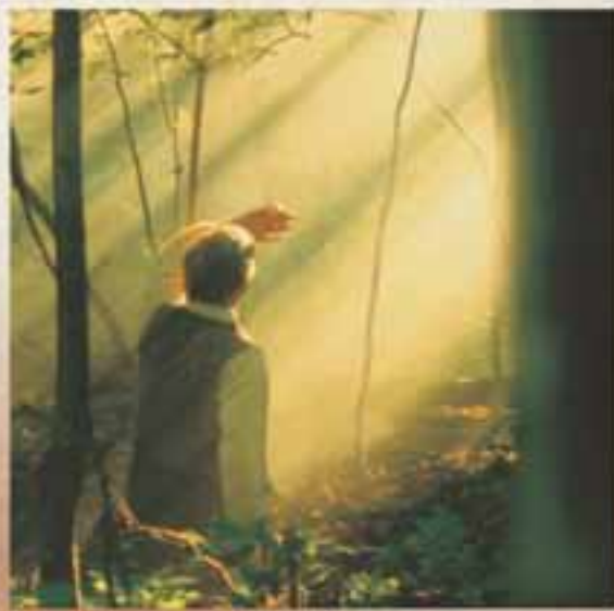
LEFT: STILL IMAGE FROM THE RESTORATION; RIGHT: TAKEN ON THE SET OF JOSEPH SMITH: THE PROPHET OF THE RESTORATION

The Prophet spent a great amount of time reorganizing priesthood quorums and councils so they would be properly organized for the solemn assembly. He insisted that the brethren be trained in the School of the Elders and in the associated Hebrew school. The journal tells of Joseph's enthusiastic and dedicated study of the Hebrew language during this time. It traces the Prophet's efforts in these endeavors and concludes by describing the dedication of the temple, the solemn assembly, and the Sunday meeting of April 3, 1836. On this Easter morning, the resurrected Christ appeared to the Prophet Joseph Smith and Elder Oliver Cowdery. Moses, Elias, and Elijah then appeared and