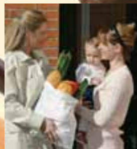
INSET: PHOTOGRAPH BY HENRIK ALS, POSED BY MODELS; OTHER PHOTOGRAPHS BY CRAIG DIMOND, BORDER © PHOTOSFIN