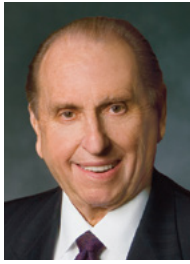
By President Thomas S. Monson