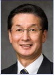
By Elder Kazuhiko Yamashita Of the Seventy