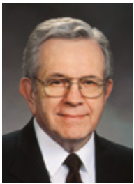
By President Boyd K. Packer President of the Quorum of the Twelve Apostles

If you have stumbled or even been lost for a time, you can move forward with faith and not wander to and fro in the world any longer.