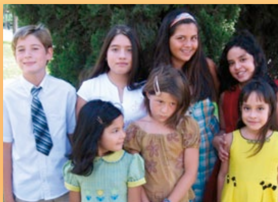
Children of the Castellón Ward in Spain learn in Primary to pray, to read and understand the scriptures, and to serve their neighbors.