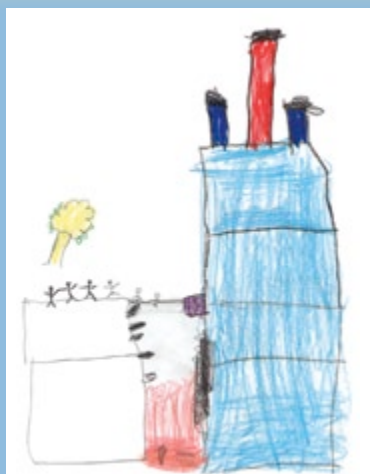
Giordano V., age 5, Peru